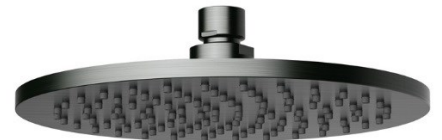
PRB1056N-GM - Gunmetal