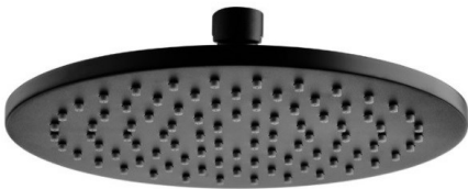
PRB1056N-B - Matt Black