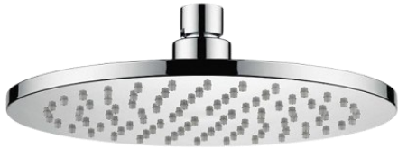
PRB1056N - Chrome