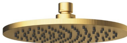
PRB1056N-BG - Brushed Gold