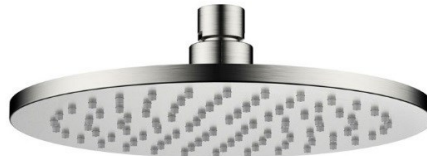
PRB1056N-BN - Brushed Nickel