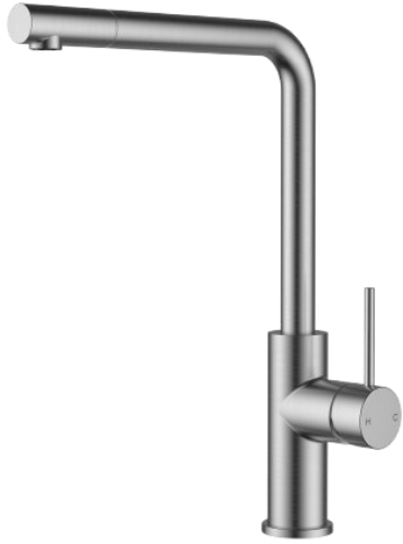
PLC10018SS - Sink Mixer - Brushed Stainless Steel