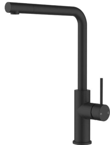
PCL1018SS-MB - Sink Mixer - Matt Black