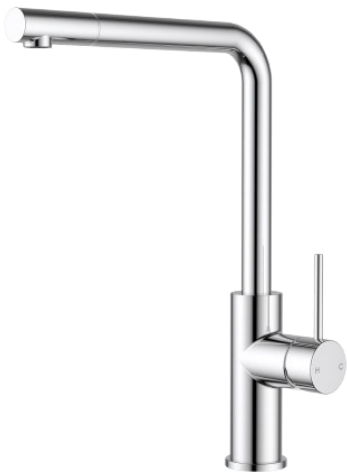
PLC1018SS-CH - Sink Mixer - Chrome