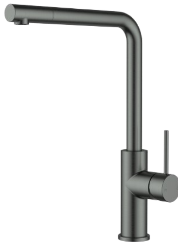
PCL1018SS-GM - Sink Mixer - Gunmetal