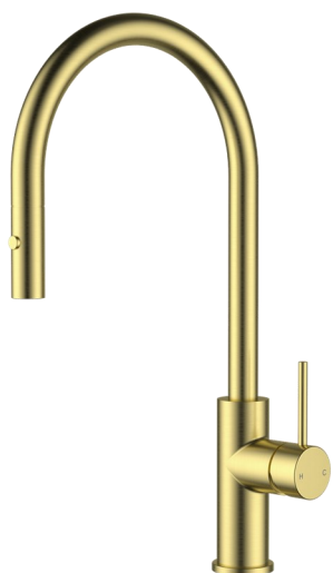
PLC1016SS-BG - Sink Mixer - Brushed Gold