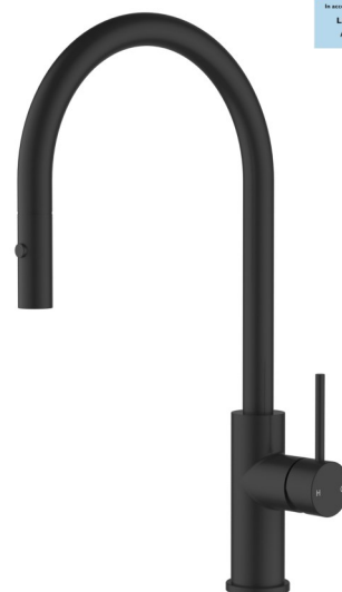
PLC1016SS-MB - Sink Mixer - Matt Black