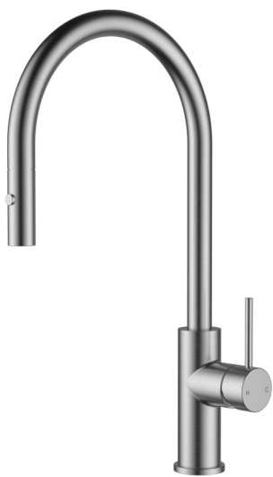
PLC10016SS - Sink Mixer - Brushed Stainless Steel