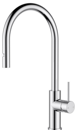
PLC1016SS-CH - Sink Mixer - Chrome