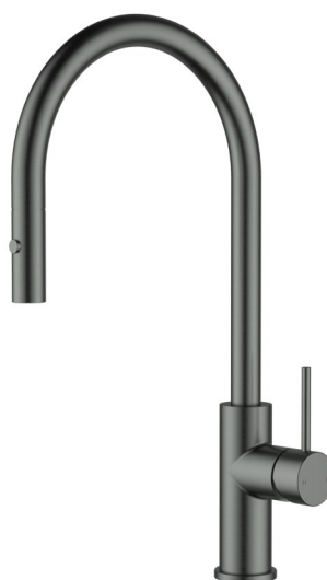
PLC1016SS-GM - Sink Mixer - Gunmetal