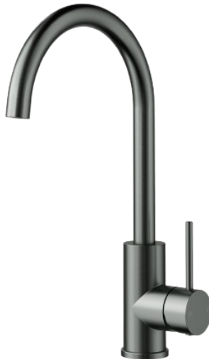
PCL1001SS-GM - Sink Mixer - Gunmetal