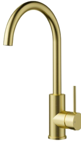
PCL1001SS-BG - Sink Mixer - Brushed Gold