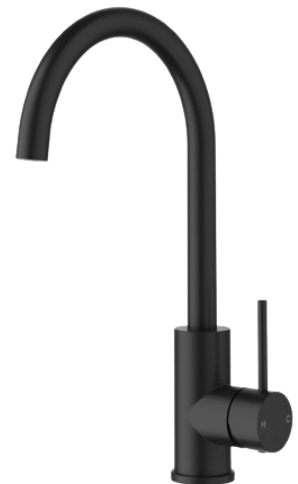
PCL1001SS-MB - Sink Mixer - Matt Black