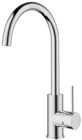
PLC1001SS-CH - Sink Mixer - Chrome