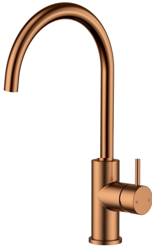
PCL1001SS-BC - Sink Mixer - Brushed Copper