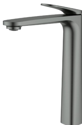
HYB168-201GM - Sulu II High Rise Basin Mixer - Gunmetal