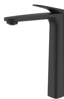
HYB168-201MB - Sulu II High Rise Basin Mixer - Matt Black