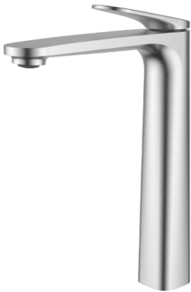
HYB168-201BN - Sulu II High Rise Basin Mixer - Brushed Nickel