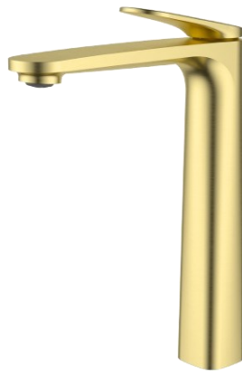
HYB168-201BG - Sulu II High Rise Basin Mixer - Brushed Gold