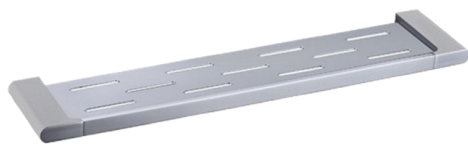
5309-1 - Chrome