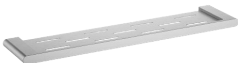
5309-1-BN - Brushed Nickel