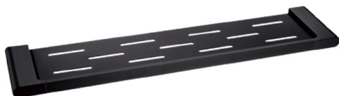
5309-1-MB - Matt Black