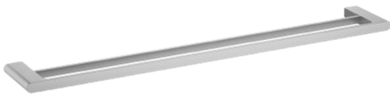
5302-800BN - Brushed Nickel