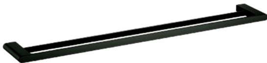
5302-800MB - Matt Black