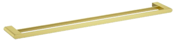
5302-800 BG - Brushed Gold