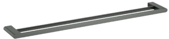
5302-800 GM - Gunmetal