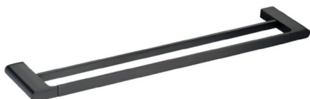
5302-600MB - Matt Black