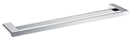
5302-600 - Chrome