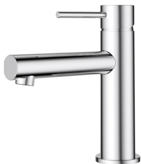
PLC2003SS-CH - **Chrome