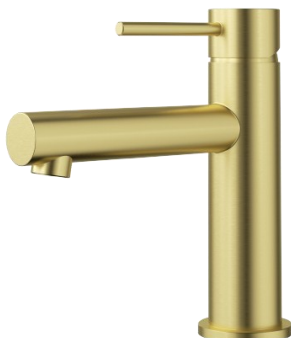
PCL2003SS-BG - **Brushed Gold