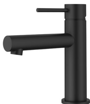
PCL2003SS-MB - ^Matt Black