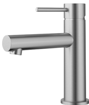
PLC2003SS - Brushed Stainless Steel