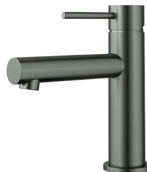
PCL2003SS-GM - **Gunmetal