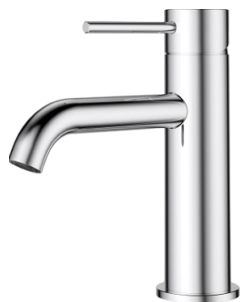
PLC2001SS-CH - **Chrome