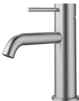
PLC2001SS - Brushed Stainless Steel