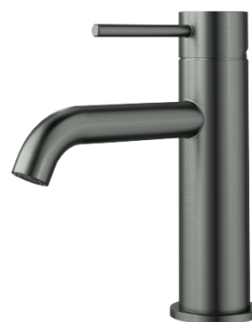
PCL2001SS-GM - **Gunmetal