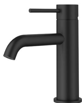
PCL2001SS-MB - ^Matt Black