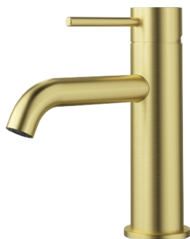
PCL2001SS-BG - **Brushed Gold